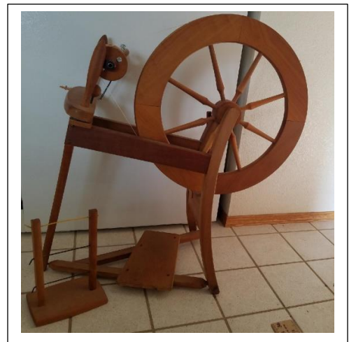
SPINNING WHEEL - MARY BRADFORD