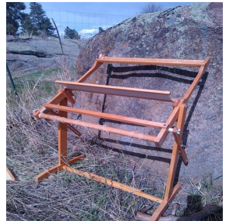
RIGID HEDDLE LOOM - LINDA KUBIK