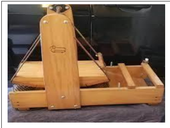
PICKER - ALLIE SELLERS