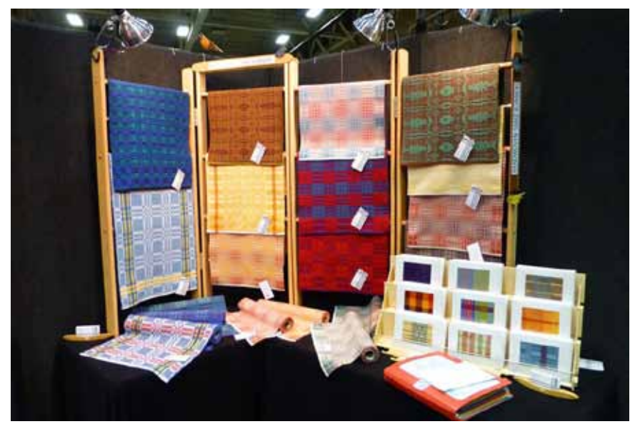
Posted by Bev Polk (on Oct. 25) Good morning! - I'm here in Great Falls showing at the annual Colors of Fall Art Show at the Expo Park. I am having a great time meeting new people and artists!