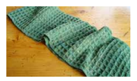
Silk and wool waffle weave scarf by Tam