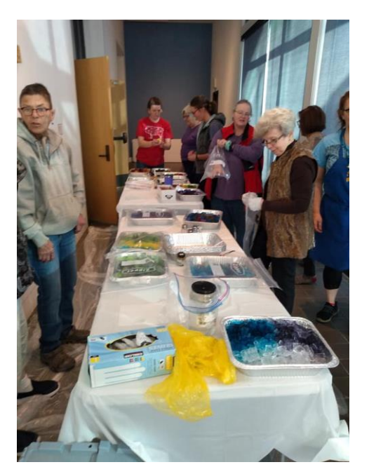
Guild Shave em to Save Em Presentation: Lincoln Longwool & Show & Tell